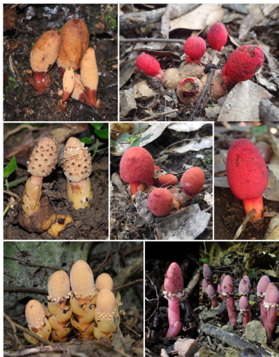
Fig. 1: Studied parasitic plants from the Balanophora genus. Top left: B. nipponica ; top and center right: B. japonica ; center left: B. tobiracola ; center: B. yakushimensis ; bottom left: B. fungosa subsp. fungosa ; and bottom right: B. subcupularis .

After returning to work from a parental leave last October, I have focused on the genomics and transcriptomics of heterotrophic plants. My main research aimed at the evolution of Japanese parasitic plants from the Balanophoraceae family. In addition, I studied the genomics of additional Okinawan parasitic and mycoheterotrophic plants.