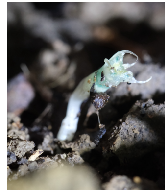
Fig. 3: Okinawan endemic mycoheterotrophic plant, Oxygyne shinzatoi .

I optimized protocols for DNA and RNA extractions from newly sampled parasitic and mycoheterotrophic Okinawan plants and submitted the samples for sequencing. Recently, I have received the sequencing data and started to analyze them. I have successfully assembled plastid genomes of two Okinawan mycoheterotrophs, including the plastid genome of the above-mentioned Oxygyne shinzatoi .