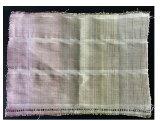
A test weaving at local studio Urasoe-Ori Association. warp: silk yarn, weft: our Itobasho yarns, A4 size (approx. 30 cm x approx. 20 cm), weft 58 yarns/inch.

1. K. Mustafina, <u>Y. Nomura</u>, R. Rotrattanadumrong, Y. Yokobayashi, Circularly-Permuted Pistol Ribozyme, A Synthetic Ribozyme Scaffold for Mammalian Riboswitches, ACS Synth. Biol. 2021, 10(8), 2040-2048.